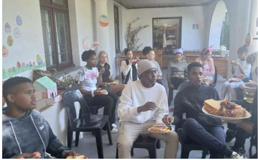
The gift of an Easter egg hunt, breaking bread together and giving to others

Our whole school was treated with some beautiful musical performances, followed by an Easter egg hunt. Our primary school children prepared a delicious feast where we all broke bread together, spent a few moments chatting before heading off to our Easter Holiday. Our school also collected groceries for a charity organisation in Stellenbosch as part of the run-up to our festival. Thank you dear Parents for your contributions, Our school family ended off Term one with bright broad smiles and full bellies. We look forward to a great break. Happy holidays!