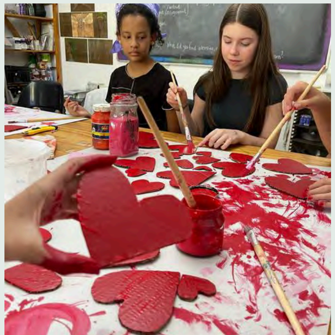
Class 8 and 9: An explosion of red - Valentine's day decorations taking shape.