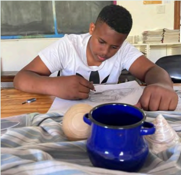
The Class 8 students observing form revealed through the play of light and dark in still-life drawings set up by themselves.