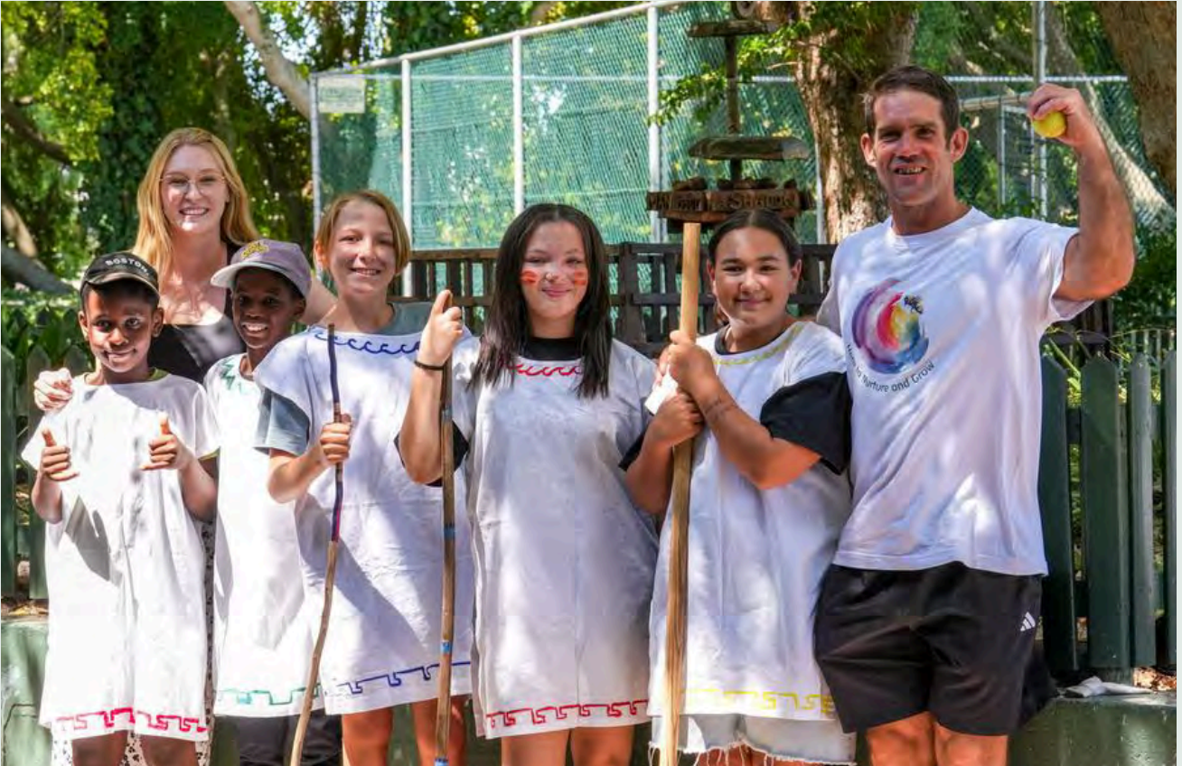
The Class 6 students enjoyed the Greek Olympics together with other Waldorf Schools at Constantia Waldorf.