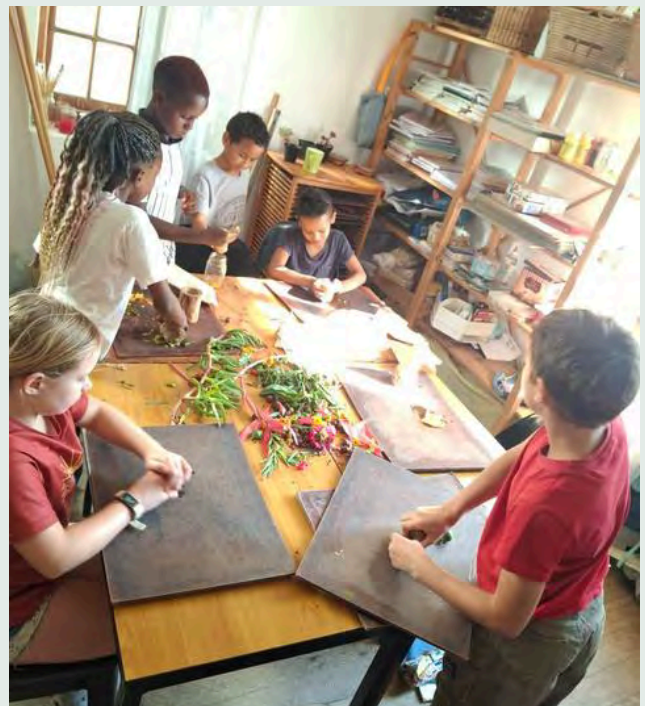
The Class 4 and 5 students are following the path of the Khoi-San in their Main Lesson, using indigenous plants to make paint.