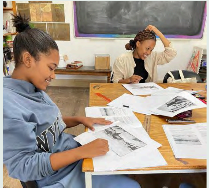
The Class 10 Visual Arts students exploring the dynamics of contrast and the subtleties of gradation in their landscape drawings.